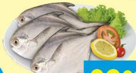
White Pomfret 200gm/300gm