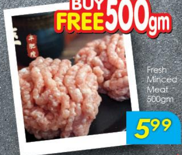
Fresh Minced Meat 500gm