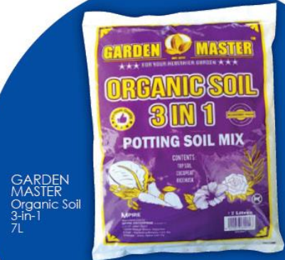
GARDEN MASTER Organic Soil 3-in-1 7L