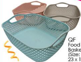
QF Food Storage Basket (Size: 28 x 23 x 10cm)