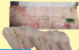
Fresh Whole Chicken Leg