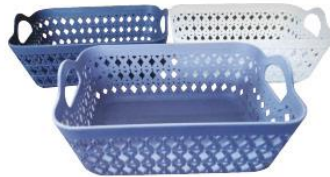
ST Plasticware Stationery Model: 030 (Size: 19 x 14 x 8cm)