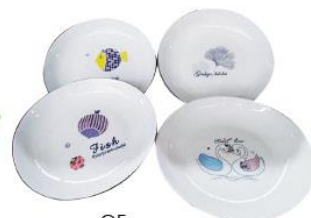
QF 8" Plate