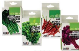
GRABBIT Vege Seeds Assorted