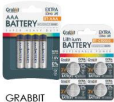
GRABBIT CR2032/AAA Battery 4pcs