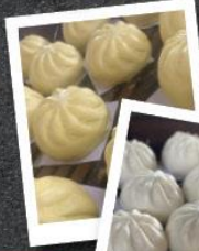
Bak Kut Teh/Char Siew Bao 6pcs