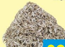
Local White Anchovies