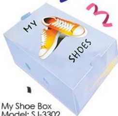
My Shoe Box Model: SJ-3302 (Size: 33 x 20 x 12cm)