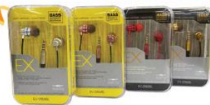
QF Earphone Metal Heavy Bass