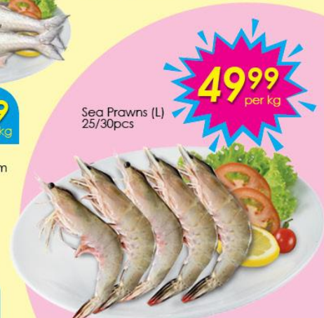
Sea Prawns (L) 25/30pcs