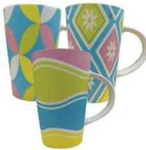
TS Cup Ceramic Model: BJ374