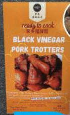
Black Vinegar Trotter 500gm