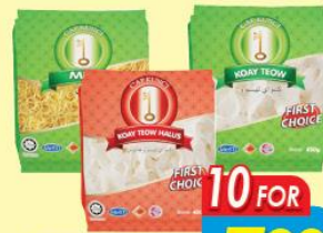
CAP KUNCI Yellow Noodles/ Kuey Teow 450gm