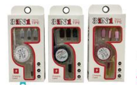
QF Fast Charging Cable 3-in-1 1M