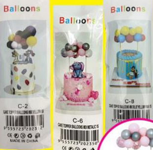
Cake Topper Balloon Mix Metallic 1pc