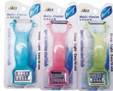
Peeler Set Model: TKW-15