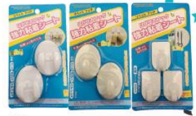
TS Hook 2pcs/3pcs Model: BJ344/BJ352/BJ355