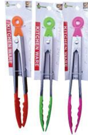
GI Food Thongs 9cm