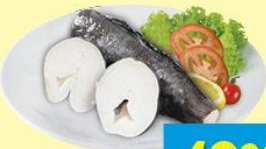
Chile Cod Fish Steak ±320gm