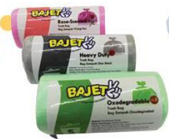
Garbage Bag Roll Drawing/Oxodegradable Star Seal/Rose Star Seal/Star Seal Size: S/M/L