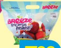
New Zealand Breeze/Queen/ Pink Lady Apples 8pcs