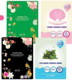
EYELIP/SKINDIGM Korea Mask 2s Assorted