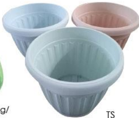
TS Flower Pot Model: LH2002C