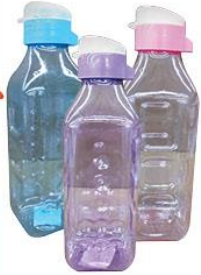
Water Bottle Model: TPW86