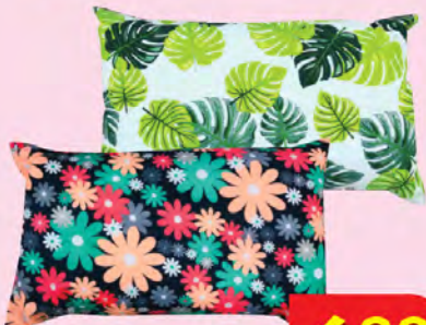
Printed Pillow (L) Model: P0062 (Size: 17" x 27")