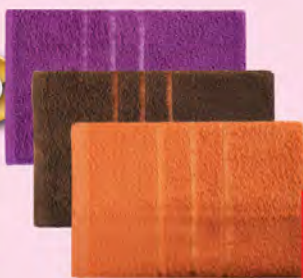
Bath Towel Model: 3L57CS (Size: 27" x 54")