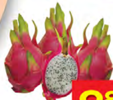
Vietnam White Dragonfruit 4pcs