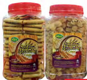
SKICO Homemade Kuih Kapit/Kuih Belanda/ Kuih Loyang 250gm/350gm Assorted