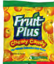
FRUIT PLUS Chewy Candy 150gm Assorted