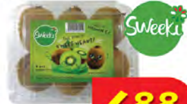
Sweeki Italy Green Kiwi 6pcs