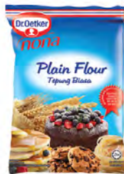
NONA Flour 900gm Plain/Superfine/ Cake