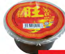
WANG New Year Cake 400gm