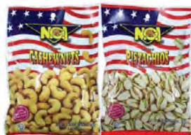
NOI Salted Pistachios/ Cashewnuts 100gm/128gm