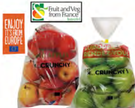
France Royal Gala/Granny Smith Apples (S) 10pcs