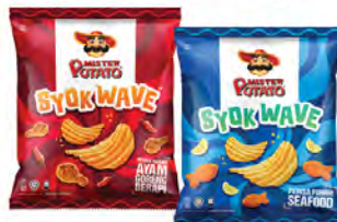
MISTER POTATO Syok Wave 65gm Assorted