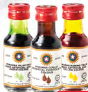
STAR BRAND Food Flavouring/ Colouring 25ml Assorted