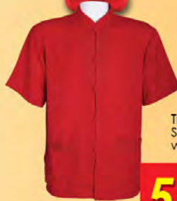
Traditional Men's Short Sleeved Shirt with Embroidery