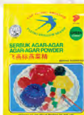
SWALLOW GLOBE/JIM WILLIE Agar-Agar/ Konnyaku Jelly Powder 10gm Assorted