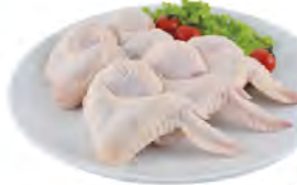
Fresh Chicken Wings