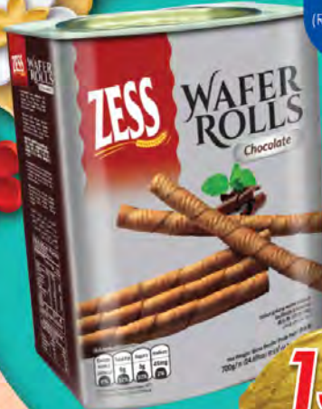
ZESS Chocolate Wafer Roll 700gm