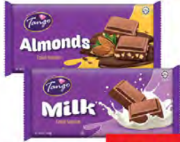
TANGO Chocolate Bar 140gm Assorted