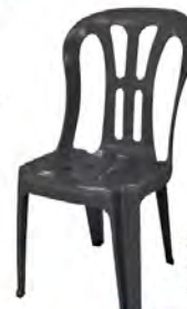
Side Chair Model: MP2188B