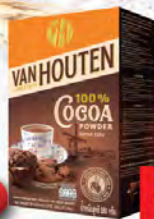
VAN HOUTEN Cocoa Powder 350gm