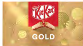
KIT KAT 4 Finger Gold Box 3 x 35gm