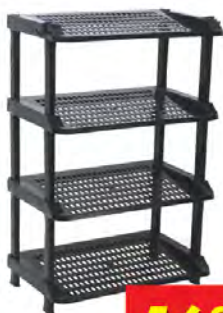
CENTURY 4-Tier Shoe Rack Model: 2288A (Size: L46 x W30 x H70.7cm)