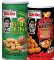
KOH-KAE Peanuts 180gm Assorted