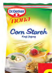
NONA Corn Starch 400gm