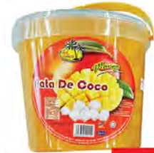
SKICO Nata De Coco 1.5kg Assorted