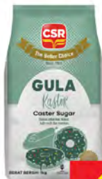
CSR Caster Sugar 1kg