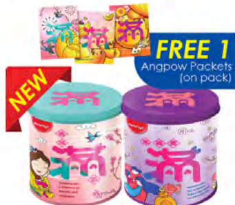
MUNCHY'S Assorted Biscuits 319gm