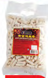
KAMI Chicken Floss Mini Roll 500gm