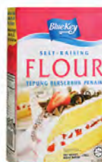
BLUE KEY Self Raising Flour 1kg