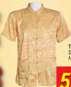
Traditional Men's Short Sleeved Mandarin Shirt