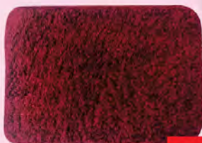
Anti-Slip Floor Mat Model: 1002 (Size: 40 x 60cm)