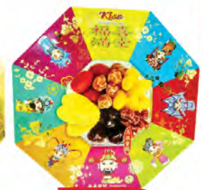
KISE Festive Preserved Fruits 450gm