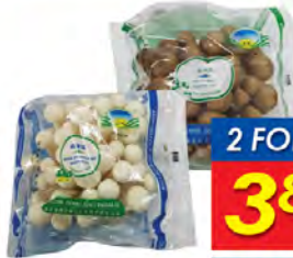
White/Brown Shimeji Mushrooms 150gm