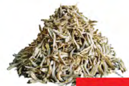
Langkawi AA Kasar White Anchovies