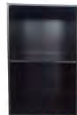
2-Tier Utility Shelf Model: 1272 (Size: H538 x D235 x W316mm)