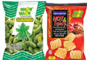
MIAOW MIAOW Snacks 60gm Assorted