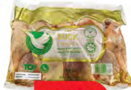
Frozen Duck Drumsticks 1kg