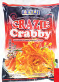
KAMI Shredded Filament Crazy Crabby 500gm