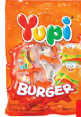
YUPI Gummy 77gm - 120gm Assorted