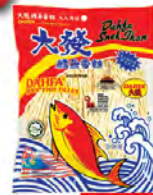
DAHFA Fish Fillets 120gm