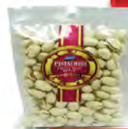
TEISTI Pistachios 180gm