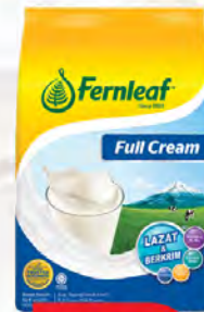
FERNLEAF Full Cream Milk Powder 900gm