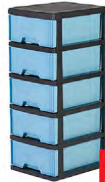
FELTON 5-Tier Drawer Model: FDR488 (Size: W310 x D375 x H785mm)