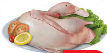
Frozen Whole Duck