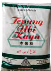
KAPAL ABC Tapioca Flour 1kg