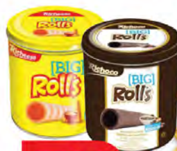
NABATI Richeese/ Richoco Big Roll 330gm