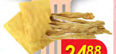
Fucuk Keping/ Fucuk Batang