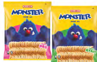
MAMEE MONSTER Family Pack Snacks 8 x 25gm Assorted