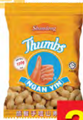
THUMB'S Shandong Groundnuts 120gm