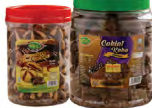
SKICO Cookies 300gm - 800gm Assorted