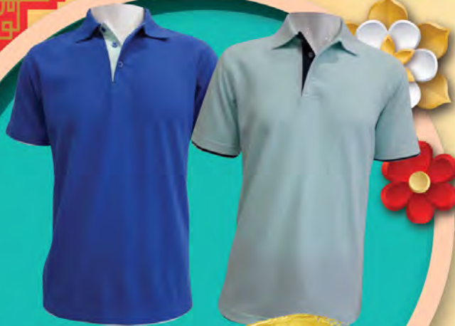
Men's Short Sleeved Polo Shirt Model: M480