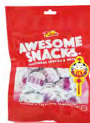
KISE Gold Coin Candy