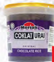
MERIAH Chocolate Rice 350gm