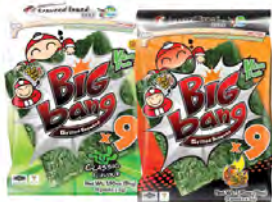
TAO KAE NOI Big Bang 54gm Assorted