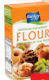
BLUE KEY Superfine Super White Flour 1kg