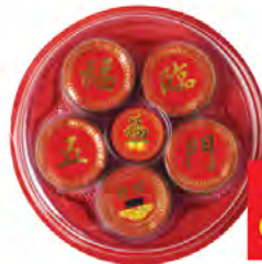
WU FU New Year Cake 500gm