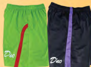
DOMINO Men's Apparel Model: SBB1000