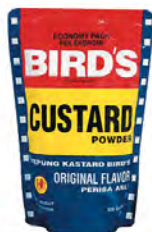
BIRD'S Custard Powder 300gm