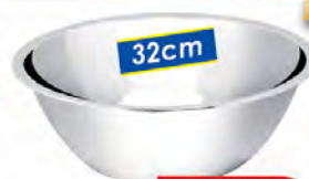
HOME PLUS Stainless Steel Mixing Bowl Model: HP1674