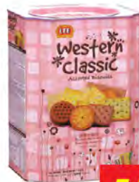
LEE Western Classic Assorted Biscuits 520gm