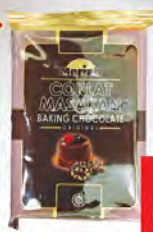
MERIAH Cooking Chocolate 500gm