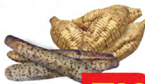
Arrowroot/ Huai Shan