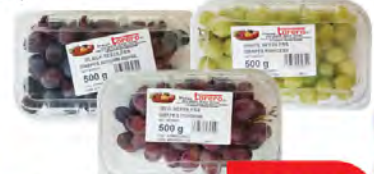
South Africa Green/Red/Black Seedless Grapes 500gm