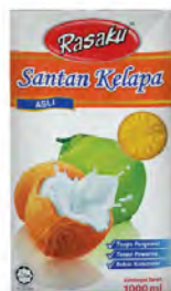
RASAKU Coconut Milk 1L