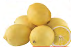
Egypt Lemons (M) 5pcs