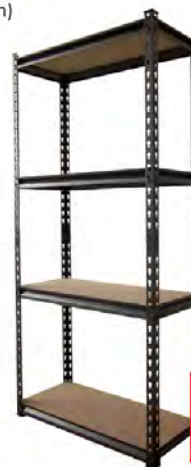
JH 4-Tier Steel Shelf Model: JH4 (Size: H152 x L71 x W30.5cm)