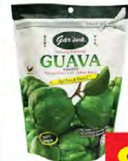
GAR'S Dried Guava 120gm