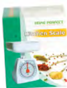
Kitchen Scale 3kg/5kg Model: EJ045/3/ EJ045/5