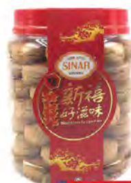
SINAR Peanut/Yam Cookies 650gm