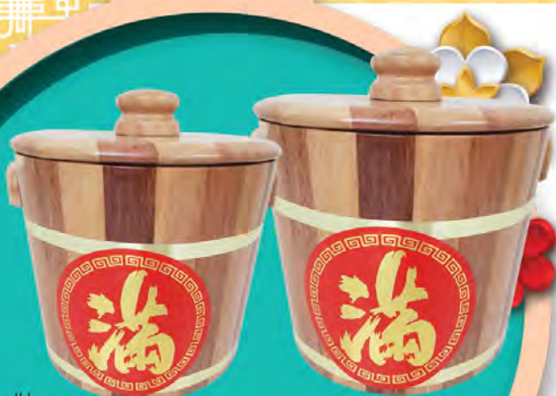
JH Wooden Rice Bucket 6kg