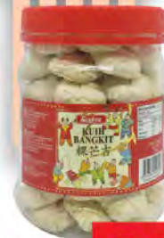
SING LONG Special Kuih Bangkit 350gm