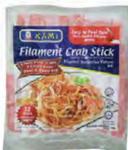
KAMI Filament Sticks Easy Peel 500gm