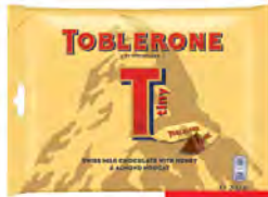
TOBLERONE Mini Milk Sharebag 200gm