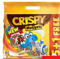
CRISPY Nuggets (5 + 1) x 30gm