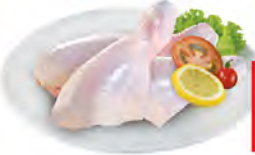
Fresh Chicken Drumsticks