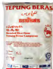
CAP GAJAH Rice Flour 1kg