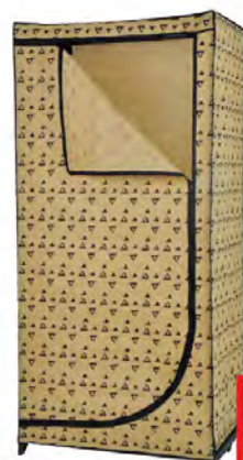
JH Non Woven Printed Wardrobe Model: JH6612 (Size: 75 x 50 x 160cm)