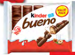
KINDER BUENO T6