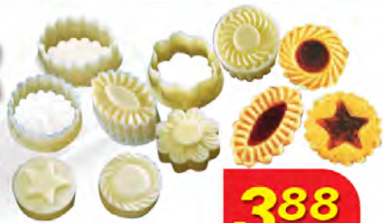
Assorted Cookie Mould