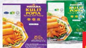
PERTAMA Spring Roll Pastry 7.5"/8.5" 500gm