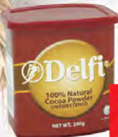
DELFI Cocoa Powder Unsweetened 200gm