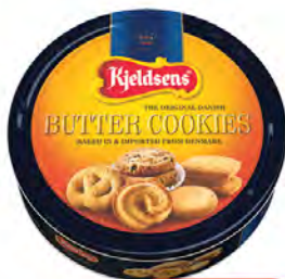
KJELSENS Butter Cookies 454gm