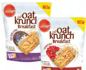
MUNCHY'S Oat Krunch Cookies 160gm Assorted