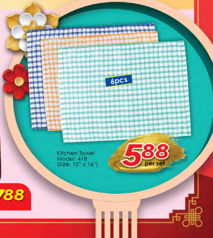
Kitchen Towel Model: 418 (Size: 10" x 16")