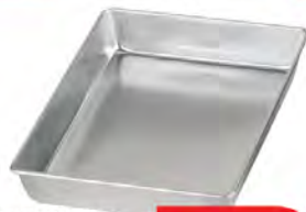
Deep Square Cake Tin Model: 4008 (Size: 210 x 210 x 65mm)