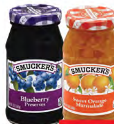
SMUCKER'S Sugar Free/Preserved Jam 340gm/361gm Assorted