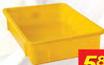
Multipurpose Tray Model: MP1081 (Size: L435 x W290 x H90mm)