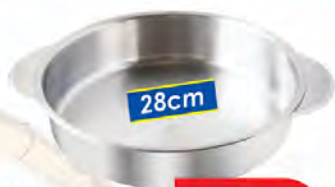
HOME PLUS Cake Tray (Double Handle) Model: HP5757