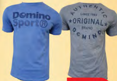
DOMINO Men's Apparel Model: SBB1500